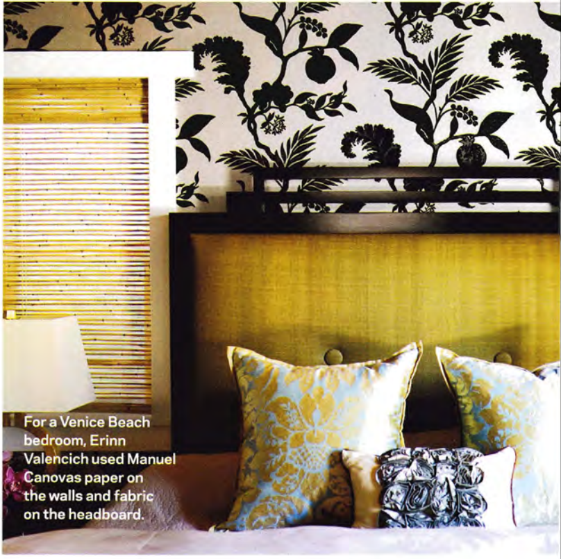
For a Venice Beach bedroom, Erinn Valencich used Manuel Canovas paper on the walls and fabric on the headboard.