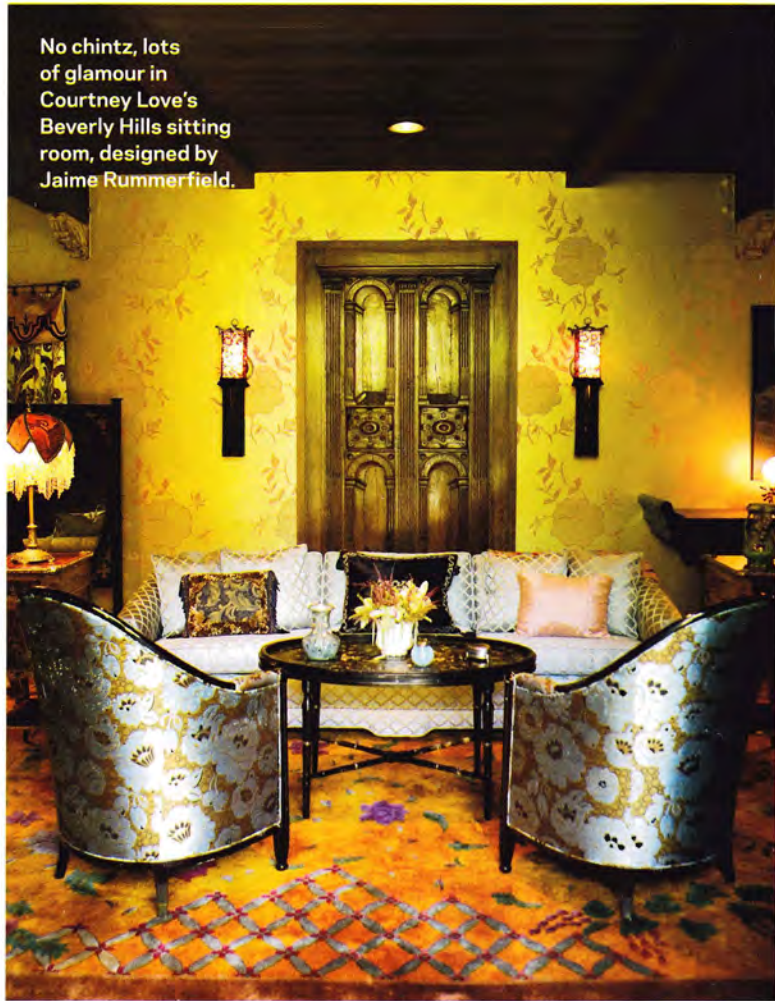
No chintz, lots of glamour in Courtney Love's Beverly Hills sitting room, designed by Jaime Rummerfield.

Whatever their ultimate ambitions, however, it's clear that these women are living for much more than just the quiet pleasures of creating well-appointed rooms for well-spoken clients with well-funded trust accounts. They're pushing the furniture around—not in Belgian loafers, but in heels high enough to scale the cliffs of fame.